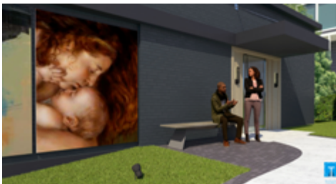
A close-up view of the proposed facade colors of the CAC facility